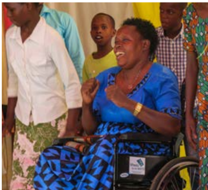
▲ Appoffie's life transformed

It is wonderful to hear how transformation continues after our international missions. We praise God that disabled people who encountered TTR in 2025 recently preached at the Reformed Baptist Convention in Rwanda, powerfully demonstrating that God commissions disabled people to serve him.