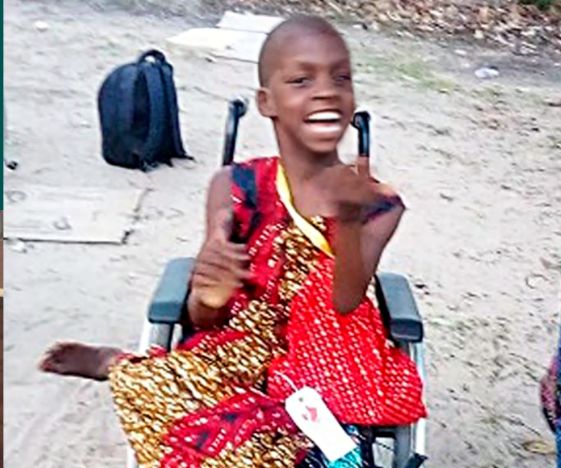
▲ Freedom to move for girl who lost her Mum in Mozambique.

Praise God for teaching hearts that disabled people too are 'made in the image of God'.