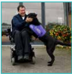
News of Disability Awareness Sunday 2024