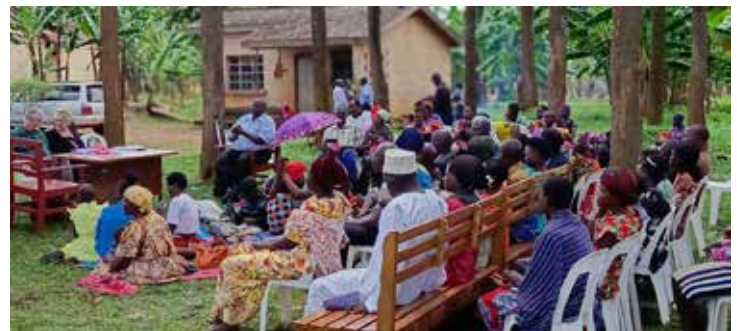
People gather in Jinja, Uganda, to hear about disability inclusion.

to all, and those who are desperate, those who are hungry for God, will come into the Kingdom of Heaven and be saved.