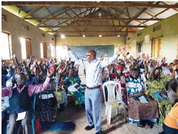
Hungry for God? Worship on the International Roofbreaker mission in Jinja, Uganda.

There is a scripture: 'The Kingdom of God is advancing and forceful men (and women) lay hold of it.' (Matthew 11:12) Perhaps this scripture is saying God's Kingdom is available