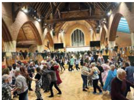
Putting the 'fun' into 'fundraising' with a barn dance at St Giles' and St George's in Ashted.

With free use of the venue thanks to the generous support of Ashted parish, a bring and share supper, amazing home-grown caller and band who gave their time and talents for free (not even charging for the plasters for their sore fingers after all that practising!) and a group of eager volunteers decorating the church and organising the raffle, costs were kept to a grand total of zero! All money