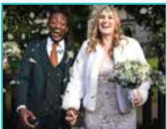
A Wheels wedding

Horizons changed and new hope was kindled for many local disabled people in Lagos and in Delta State, Nigeria, when they were given mobility equipment by Through the Roof.