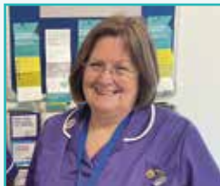
Luke 5 award for Parish Nurse