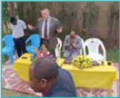
Trevor asks: 'Are we hungry for God?'