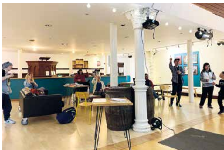
Enjoying Makaton in worship at the Cardiff event.