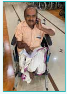
Helping people to hear the word of God