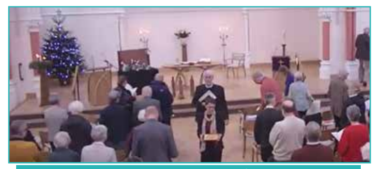
Downing Place URC, Cambridge, kept fundraising simple.

We are so grateful for the generosity of those who donate to TTR, and also to those who give their time to support the work. Fundraising has three blessings – it blesses the giver, it raises money, and it spreads awareness of what God is doing through TTR. We pray that God will give us