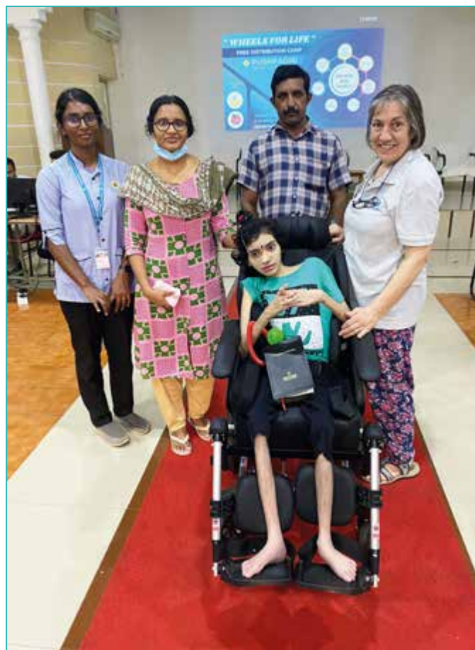
Working with the fantastic team at Pushpagiri hospital

The joy and smiles that radiated from these children were a testament to the profound impact of their work.