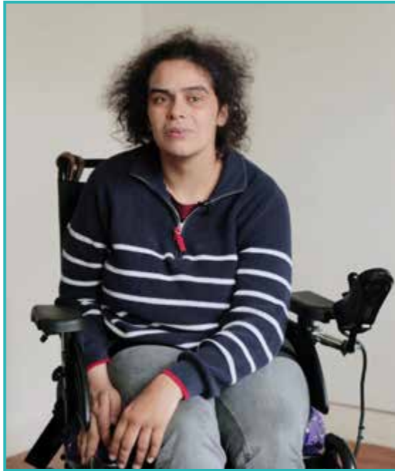
Please pray for churches to take the opportunity of Disability Awareness Sunday