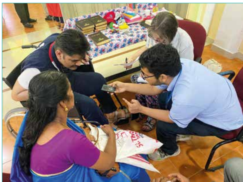
The team shared the wonderful new audio Bibles

Throughout their journey, the team encountered numerous heartwarming moments, including their visit to the 'Little Servants of Divine Providence' home for disabled children. The therapists and technicians carefully assessed eight children in need of wheelchairs, and as each child adjusted to their newfound mobility, their transformations were dramatic and moving. The joy and smiles that radiated from these children were a testament to the profound impact of their work.