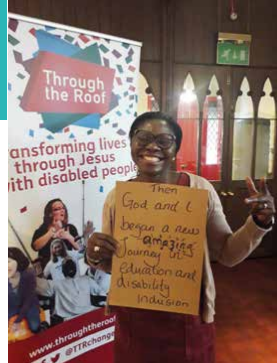
We'd love to hear about lives that have been changed by Through the Roof

So, every story counts, and you never know how God will multiply its impact!