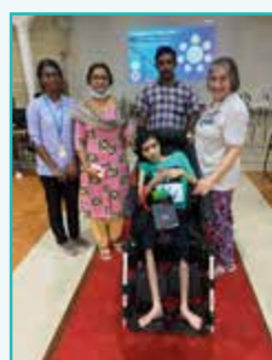
Transformation in Kerala