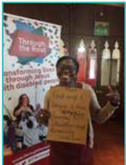
Share your stories