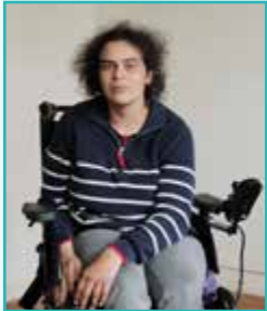
Pray with us for Disability Awareness Sunday