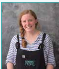
Making sense of our senses