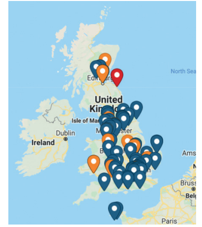
Visit the map at www.throughtheroof.org and sign your church up

As well as these Networks, Through the Roof offers Church Disability Awareness workshops, a Church Disability Toolkit and a church audit document – all of which are FREE for churches with Roofbreakers. There's also a Facebook group where Roofbreakers can share information and ideas.