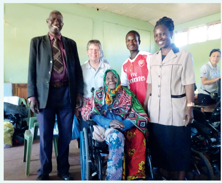
We'll be back working in Kenya in 2022

We are delighted that so many people are signing up for our Roofbreaker International programme, which was launched in response to the global restrictions, particularly in East and West Africa. This is enabling those who lead disability programmes in their respective countries to meet their counterparts in their neighbouring countries. Together they are drawing in and encouraging those within their local Church communities to sign up as a Roofbreaker and show Jesus' love to disabled people.