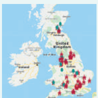
Help Us Spread The Message