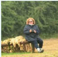
Life-Transforming Disability Inclusion