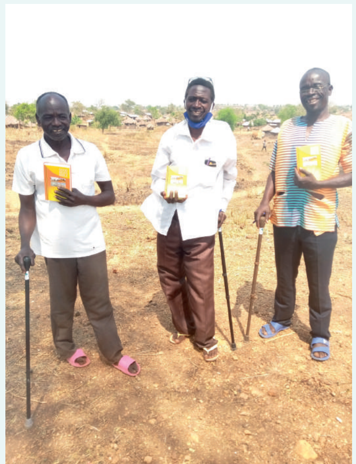
Three recipients of mobility aids on our Uganda Supported Distribution

We remain committed to our work alongside our international partners and are thankful to God that the pandemic has challenged us to find alternative ways of helping them. We want to ensure that the needs of disabled people are met through our ongoing Wheels for the World programme, using technology to support them. In addition, a new project aims to provide disabled adults with the skills, training and tools to generate an income. Your prayers and financial support are vital in helping us as we continue to work alongside our partners to reach disabled people in the global south and other developing countries around the world.