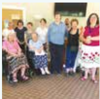
In At The Deep End