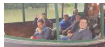
Get in touch to find out more about our accessible and welcoming holidays