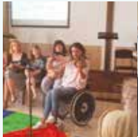
Is Disability Good For Us?