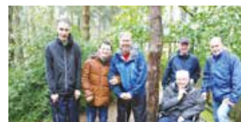
Join us for a break in 2020