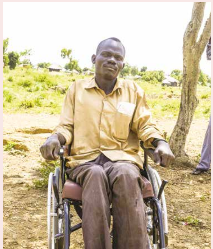
Your support means Maurice can now access medical care

You can find videos, photos, and many more stories from the trip to the Refugee Centres in North Uganda at www.throughtheroof.org . See earlier in the magazine for details on joining a future trip.