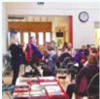
Disability Inclusion In Our Churches