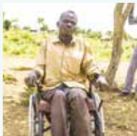
A Changed Man