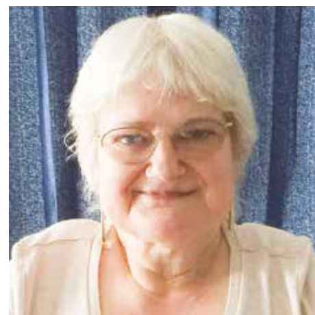
Thank you to everyone who's already welcomed them to TTR

"...the King will say, 'I'm telling the solemn truth: Whenever you did one of these things to someone overlooked or ignored, that was me—you did it to me.'" Matthew 25:40