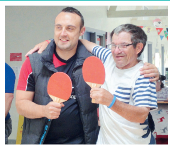
Visit www.throughtheroof.org and start your journey towards promoting Roofbreakers