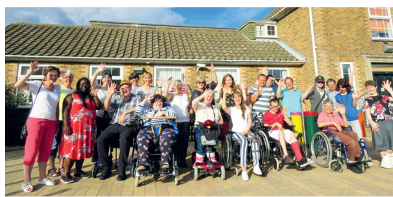
Book now to join us next year!