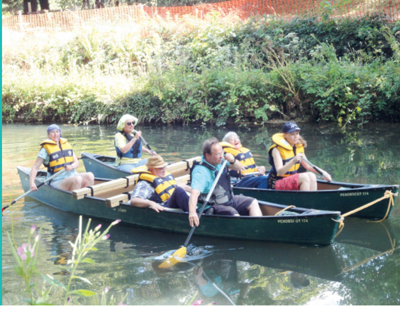
Accessible fun on the river

Creatures great and small at the animal encounter