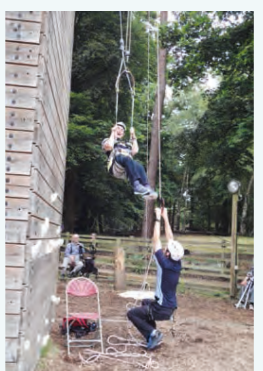
Access all areas!

At Through the Roof we are very conscious of problems of access in