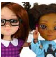
The Father's Business