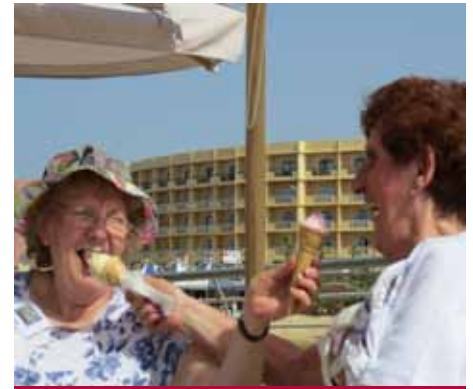
Helpers and guests enjoyed Maltese treats

We went on two excursions, the first to visit dolphins, parrots, and seals. The parrots were a real favourite with everyone as they showed off their many tricks. A later visit to Marsaslok and a colourful market was very popular, and many people came back with lighter purses having purchased new wheelchair bags and other gifts for home. Of course, the obligatory ice