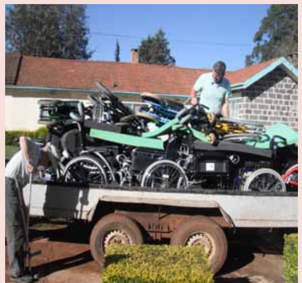
The right items – like these wheelchairs in Kenya – can change lives

answer queries about donations, so please get in touch before dropping anything off, and we'll be happy to advise you.