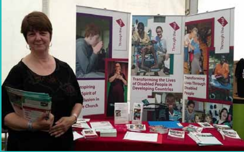
Ros ready to introduce people to TTR