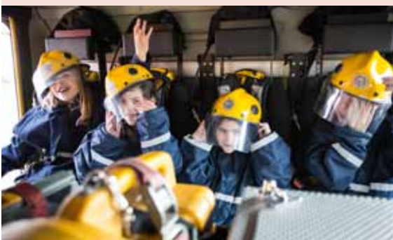
Your support makes things like the Dalesdown holiday possible – Thank you!

We're very grateful to everyone who partners with us in offering their prayers, time and money to help change people's lives with God's help. Many people choose to give regularly to Through the Roof by standing order through their bank, which gives us greater stability and helps us in planning future activities - a real encouragement to us! If you don't already, we'd love for you to consider donating in this way. It's straightforward to set-up, and you could spread your giving over the year, perhaps by giving £2 or more a month. If you contact your bank and ask them to set up a standing order, they'll ask you how much and how often you want to donate. Give them our bank details sort 40 – 52 – 40 A/C 00008105 and the whole process will happen automatically and easily. If you get in touch with us, we'll be happy to talk you through it or send you a form to forward to your bank.