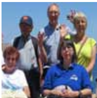
Ten Days in Paradise Bay