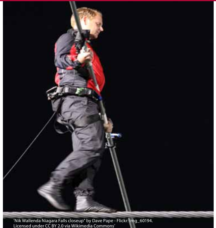
'Nik Wallenda Niagara Falls closeup' '

I wonder how far your faith takes you, what level of risk are you willing to take because you believe in a God who loves and cares for us? We could turn that question around and ask ourselves do we ever step ahead in faith, taking a risk, or do we go our own way all the time. It's challenging isn't it? Remember in your prayer times to give God time to answer your prayers, then when you hear Him answer the risk you take will be considerably less, for you will KNOW you are taking the leap of faith by God's direction!