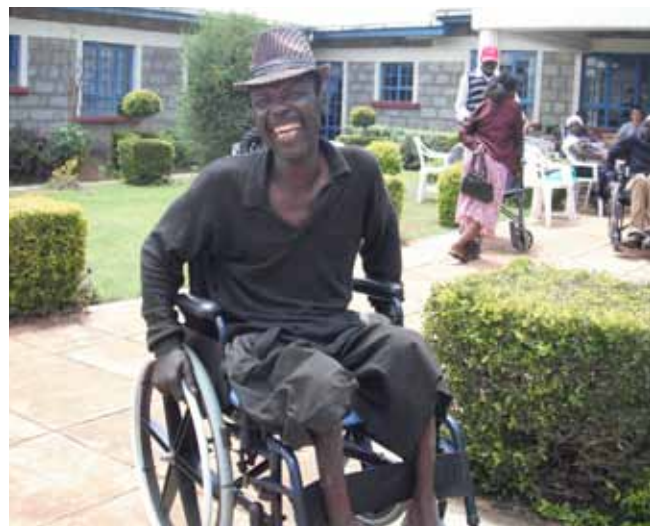
Your wheelchair sponsorships change lives!