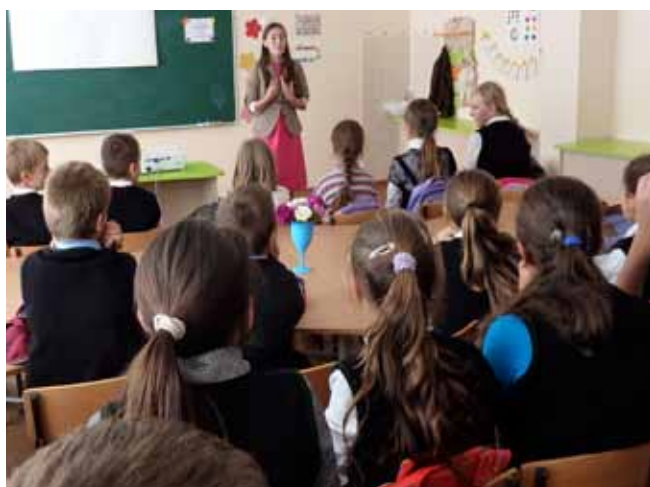
Last year's Churches Inc trip to Moldova brought training and encouragement to churches and community workers

Plans are coming together for our international work in 2016 – If you're interested in taking part, praying specifically, or financially supporting any of these trips, please get in touch.