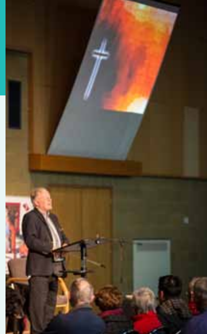
The Enabling Church Conference and Course have helped lots of churches work deliberately to include disabled people

Another Enabling Church conference is planned for the 11th November in the London area – please see www.churchesforall.org.uk for more details. The full report can be found at: http://churchesforall.org.uk/enabling-church-research-published/