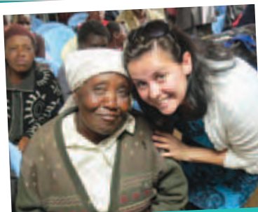
Reninca will be staying in touch with the work - all trips are ready to go!