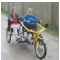
Take in Break in 2015