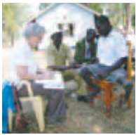
God Does More Than We Could Ever Imagine

This trip has changed the lives of over a hundred families, just like all Wheels trips change lives. It's your support that makes them possible – please click on https://www.justgiving.com/ttr/ to donate.