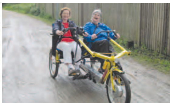
Plenty of different activities for everyone on our Treloar holiday

We believe that integral mission through the church is the way to meet the ever-changing needs and diversity we've encountered in our Integr8 trips. Since 2008, we've visited many communities as part of our overseas inclusive education missions, and seen great changes in all of them. Over that time, the needs of our partners and visited countries have broadened, and in 2014 we trained not only teachers, but a growing number of church leaders, government officials, social workers, disabled people and community leaders. As such, our Integr8 trips will now be called Churches Inc trips. The principles and