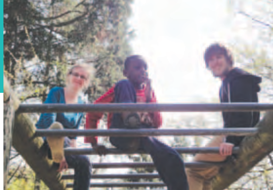
Twice the fun with two Dalesdown holidays in 2015

Contact Jenny at the office to find out more and to book. We're also looking for caring helpers for all of these holidays. Could you help someone to have a much-needed break?