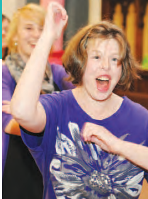
Roofbreakers work in their churches to make a positive change for all