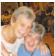
A Wealth of Wisdom