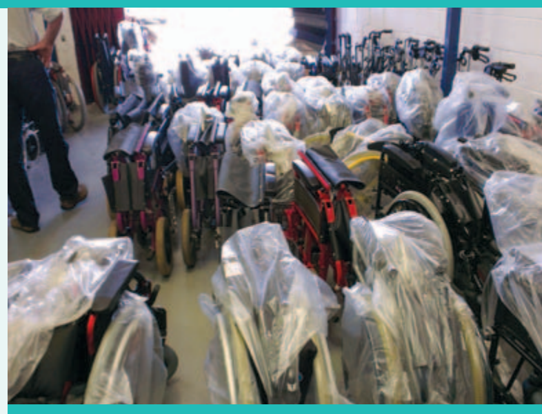
Wheelchairs at the warehouse - ready for loading up

We also need drivers to do various trips around the country to collect or drop off chairs. This would be infrequent work, but really help in all we do with Wheels.