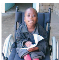
Sleepless Nights to Change Lives