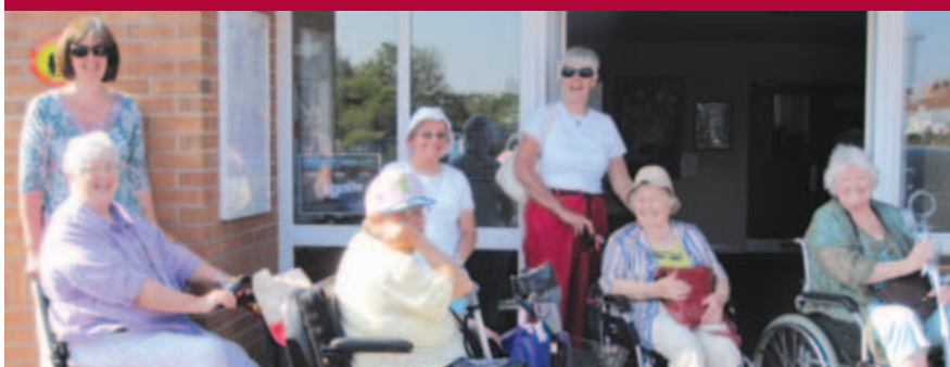
Fylde Coast, off on their Trafford Centre trip