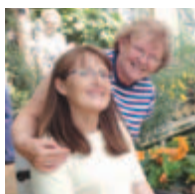
'Going the Extra Mile'