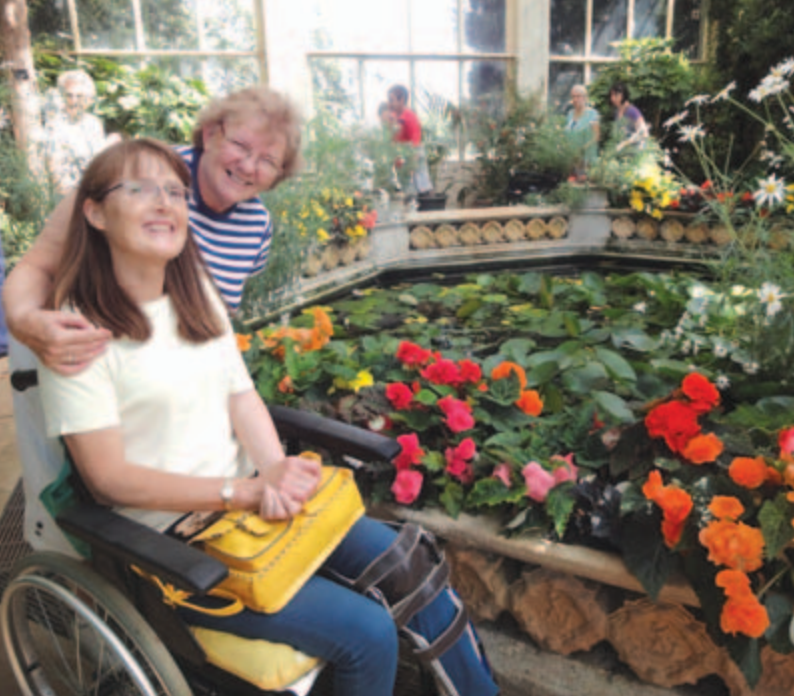
Laughter and sharing on the Hinwick Holiday