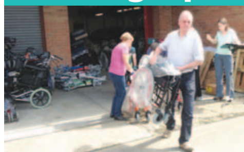
Loading up over 150 chairs at the Aldershot Warehouse

The Aldershot warehouse saw its first ever container-loading in August. 156 wheelchairs and many more mobility aids were loaded up by a team of staff and volunteers, and are now on their way to Ho, Ghana. Are you in the Aldershot area, and able to help out next time? All help would be very welcome! We're also looking for a regular warehouse volunteer to help out at the Aldershot unit for around a day a week – the role would involve assessing wheelchairs, sorting and packaging crutches and Bibles and some light cleaning of wheelchairs, and full training would be given. If you're interested in helping out in any way, please contact us at the office.