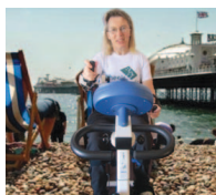
54 Miles of Fund-Racing