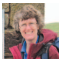
'Coast to Coast'