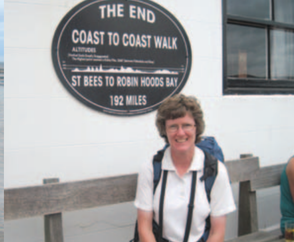
The end of an amazing journey!