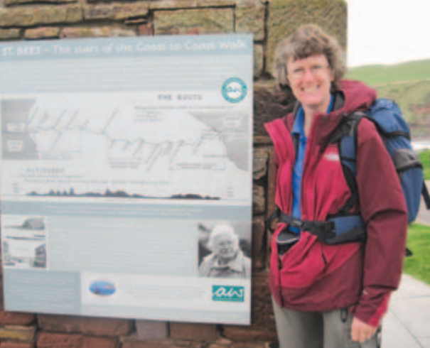
Ready for 192 miles, at the start of the Coast to Coast walk