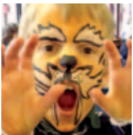
A Life-Changing Holiday