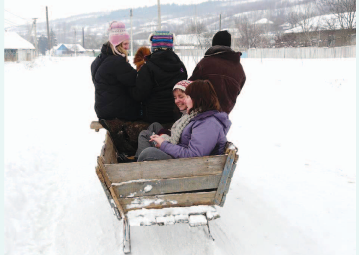
Winter travel on the 2012 Moldova trip. This year's mission will build on our earlier work and contacts in Dancu.

Our team will be spending eight days in Dancu, a rural area in the southwest of Moldova, near the Romanian border. Moldova is caught along the West/East divide. At one time a part of Romania, it came under Soviet control after the Second World War. With the collapse of the Soviet Union, it was left without clear direction, and remains unable to convince the EU that it meets the requirements for membership. Moldova is in great need of ways to