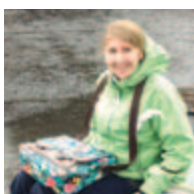
Walk a Mile in my Shoes