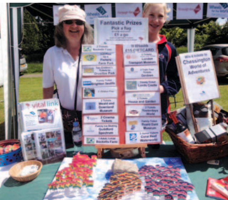
Excellent fundraising work at the Ashtead village day, where dedicated volunteers collected £650 for Wheels.