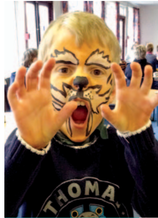
Face painting and craft were popular on cold spring days!

'As Dalesdown arrived and as my little chap got out of the car, it became apparent that he had a lot of energy, as he began to run up and down the field for over 2 solid hours! I couldn't keep up with him and knew I wasn't going to cope. I felt such a failure.