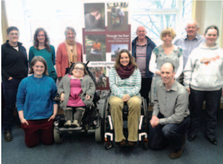
Our Bath Area Network at their first meeting. Groups are now meeting in Edinburgh, Bath and Liverpool