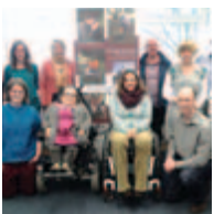
Energising Area Networks