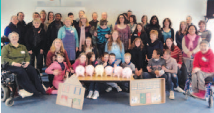
Another great year!