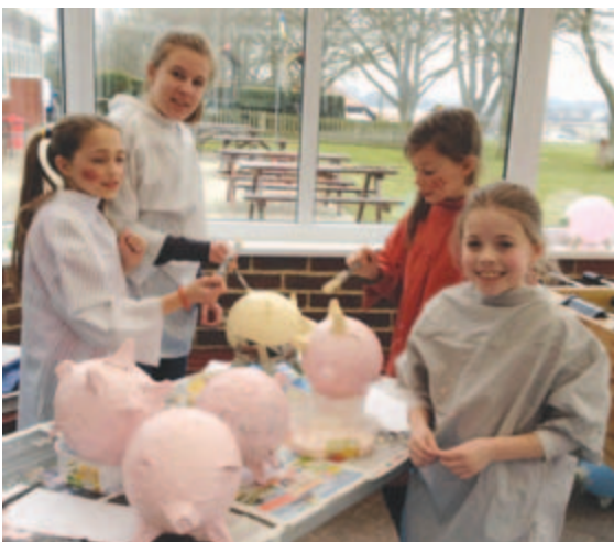
Lots of the children made papier-mache pigs during the week