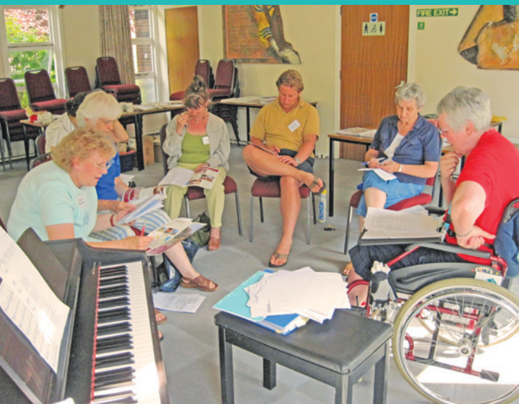
DCF Holidayers in prayer