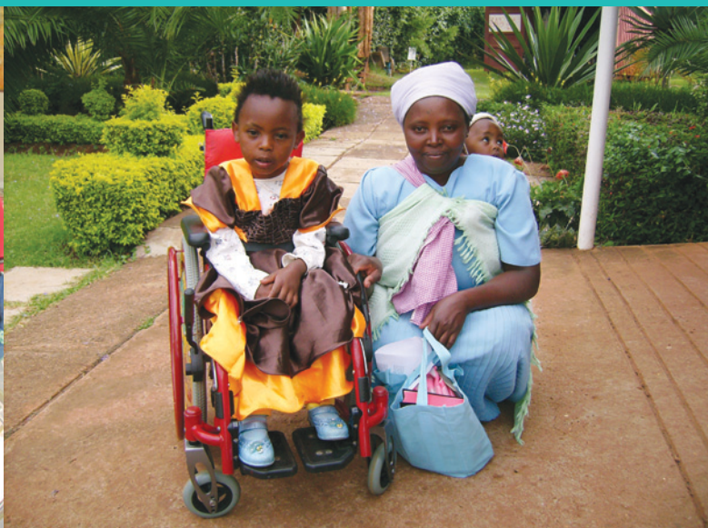
A wheelchair recipient and family in Nyeri