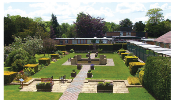
The sensory garden at Hinwick