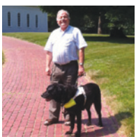
'It's Not Fair'