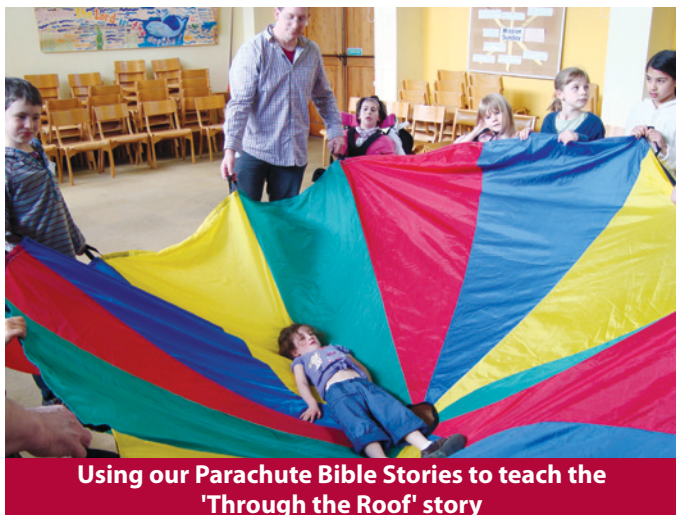
Using our Parachute Bible Stories to teach the 'Through the Roof' story