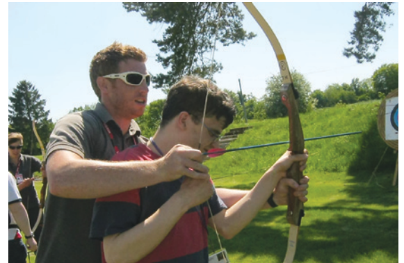
Take part in archery and other sports

the office for an application form if you are over 18 and interested in coming. Places are limited.