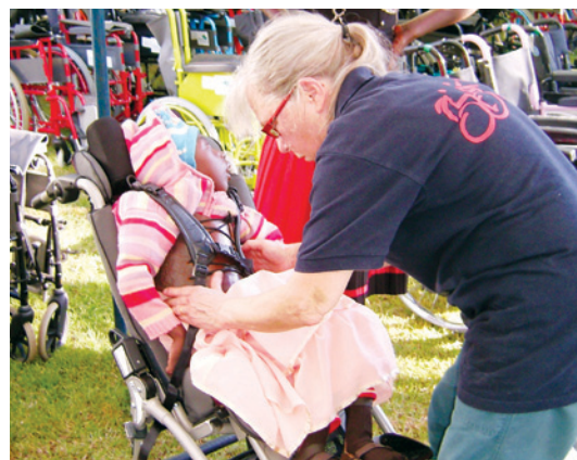
A Wheels team member works to fit a chair to a child in Nyeri