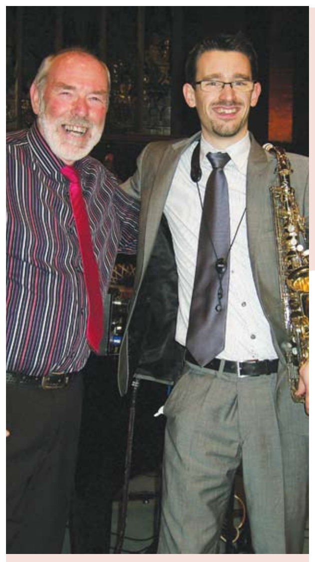
Players at the Jazz Café

It was a successful concert. I couldn't have been more grateful to the helpers from the church and to the band." Further details of the band may be found on their website www.stardustbigband.co.uk .