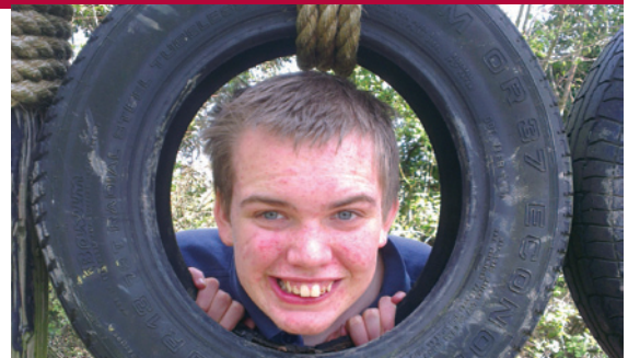
Dalesdown Plus will feature new activities for families with teens

Our Easter holiday for families with autistic children is almost full and ready to roll, but there are still places available for the first 'Dalesdown Plus' holiday coming up in October. This new holiday will be aimed at teenagers rather than younger children, and will run during the half-term break, from 27th - 30th October. It will still be all-inclusive, with one-to-one helpers provided, but the programme will include some exciting