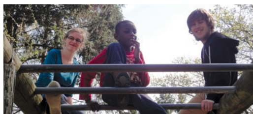
The holiday still offers relaxation and one-to-one support

new age-appropriate features such as a puppet-making workshop, T-shirt painting and bonfire night.