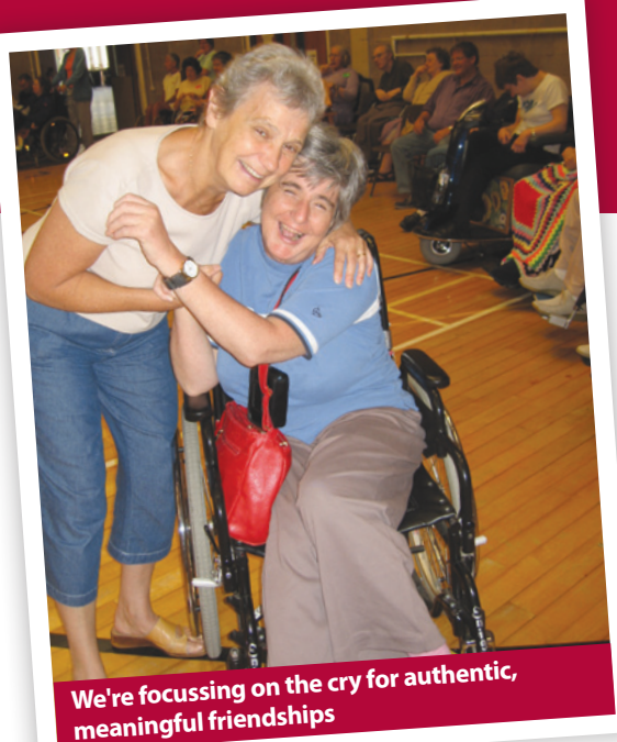
We're focussing on the cry for authentic, meaningful friendships

How are you planning to mark Disability Sunday? Is your church doing anything new or out-of-the-ordinary? Get in touch to let us know, or leave a comment to spark discussion on our facebook page at www.facebook.com/throughtheroof .