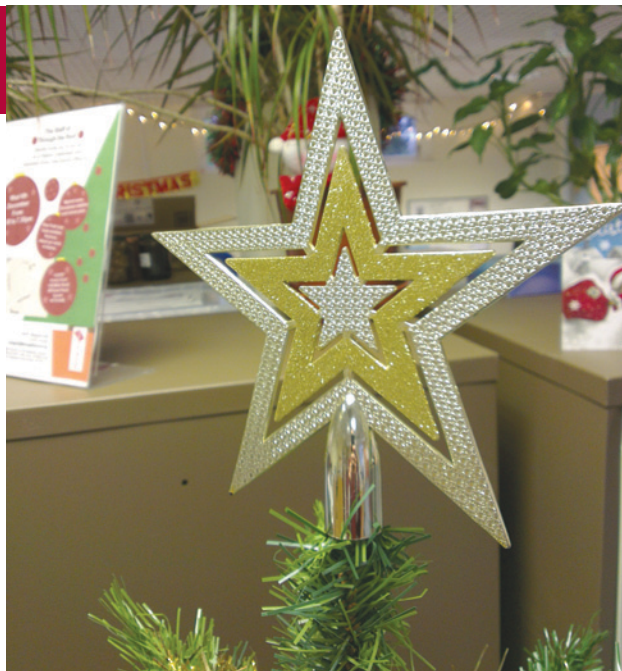
Joni Eareckson Tada