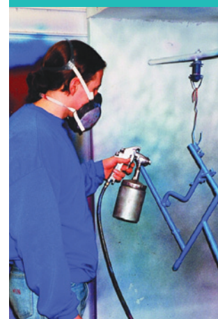
Prisoners make a contribution and learn skills