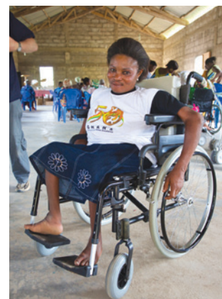
Every chair and gift makes a difference

Visit www.3in1gooddeeds.org to do your good deed for the day.