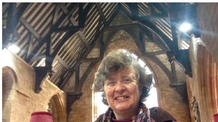
Roofbreakers are springing up everywhere, including this supporter in Shropshire