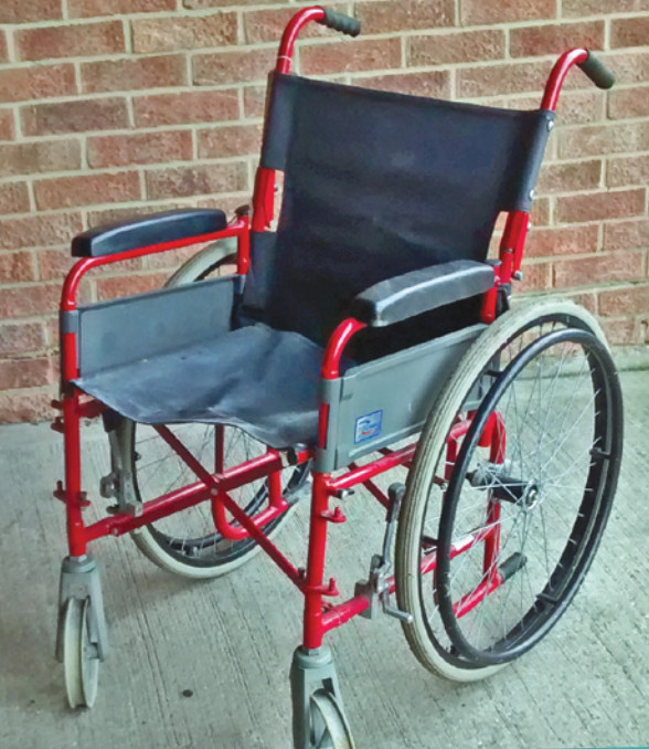
A well-used chair, ready for a new life