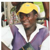
I Can Now Talk to People Face-to-Face