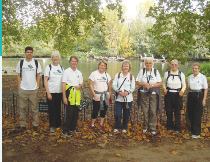
Our team of walkers ready for their hike

We were fortunate with the weather and the parks were beautiful in the Autumn sunshine. We stopped to admire the pelicans as they spread their wings in St. James Park and watched numerous herons by the lake in Regents Park. A highlight for several members of the group was passing the Park Lane memorial to animals killed in the First World War, and the amazing views over London which rewarded us following the climb up Primrose Hill.