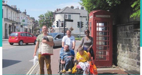
Take a relaxing break in Babbacombe

We're also excited about our seaside holiday at Babbacombe in Devon - some places are still available. We'll stay in a hotel with sea views from most rooms from 12th - 19th September, have at least one outing during the week, and (weather permitting) we'll enjoy some lovely seafront walks.