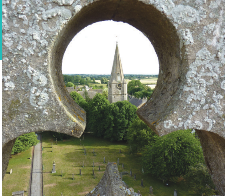
There's a Roofbreaker at Malmesbury Cathedral

The equipment goes with prayers from Northern Ireland that it may bring freedom to all those who receive it. Children's wheelchairs are a particular focus in Northern Ireland, and the team continue to look for used manual chairs, all to bring freedom and independence to children in developing countries. If you have anything suitable in NI, please get in touch with the office on ni@throughtheroof.org