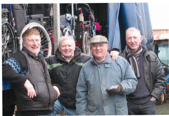
Thanks to our intrepid loaders

Roofbreakers were also sent their first monthly encouraging e-newsletter, while Through the Roof has already initiated Area Networks so Roofbreakers can meet together for prayer, encouragement and share news and ideas in their geographical location.