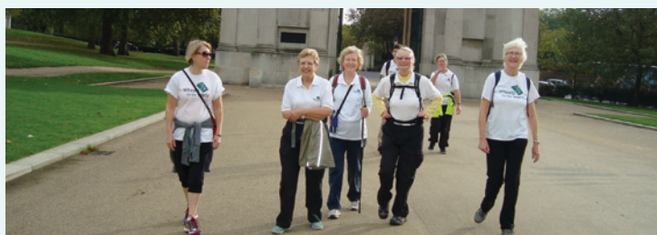
Get in touch to find out some fun ways to fundraise

Our Wheels for the World t-shirts sparked interest with passers-by, and we had a conversation with a young man from one of the African countries Wheels visits who was moved that there were people in London putting effort into raising funds to benefit his fellow countrymen.