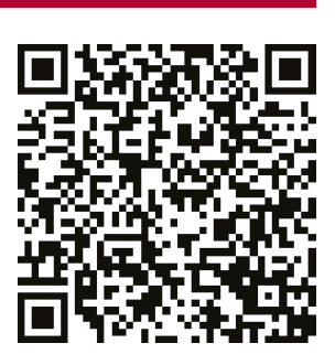
Scan this code with your phone to go straight to the survey

We'd love to hear about your experiences—they could help shape how we work with churches for the next five years!