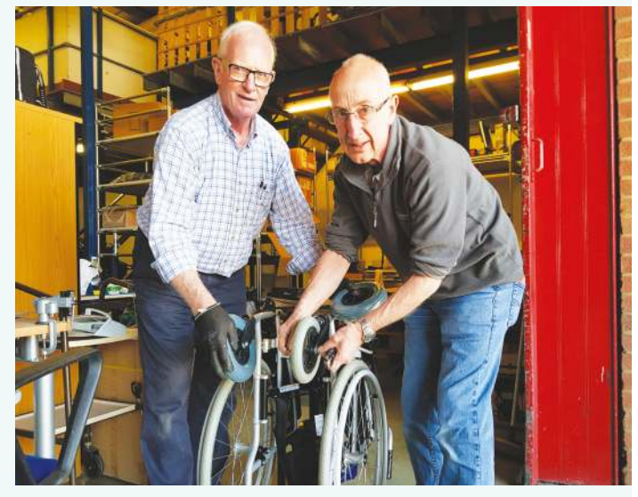
Thank you to all our volunteers at the warehouse!

God has also been working behind the scenes at our warehouse. Over the past two years we have seen many volunteers give up their time to go every Wednesday, clean