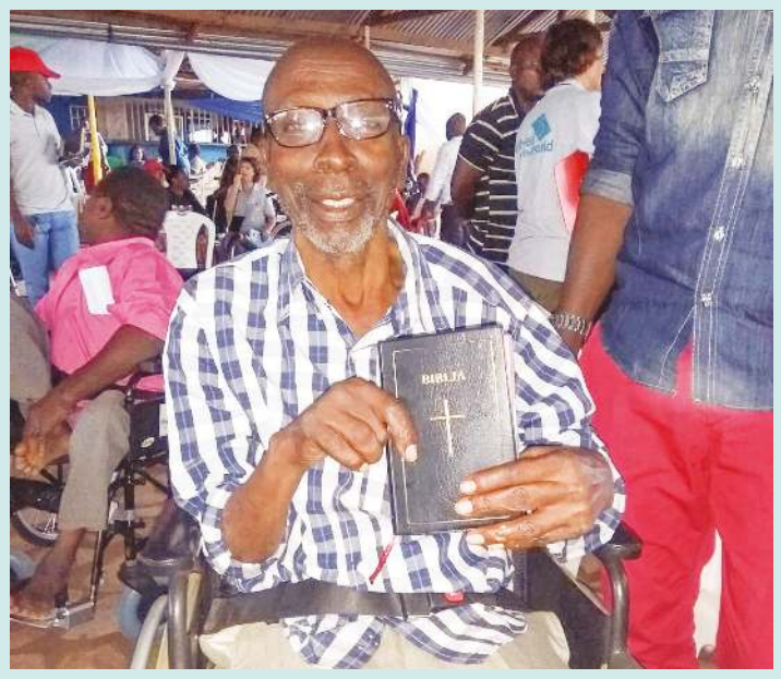
It was amazing to think that this man who had not been able to leave his bed for 13 years without being carried now wanted a Bible far more than the wheelchair

We rely on your support to fund these amazing trips. Please visit www.throughtheroof.org