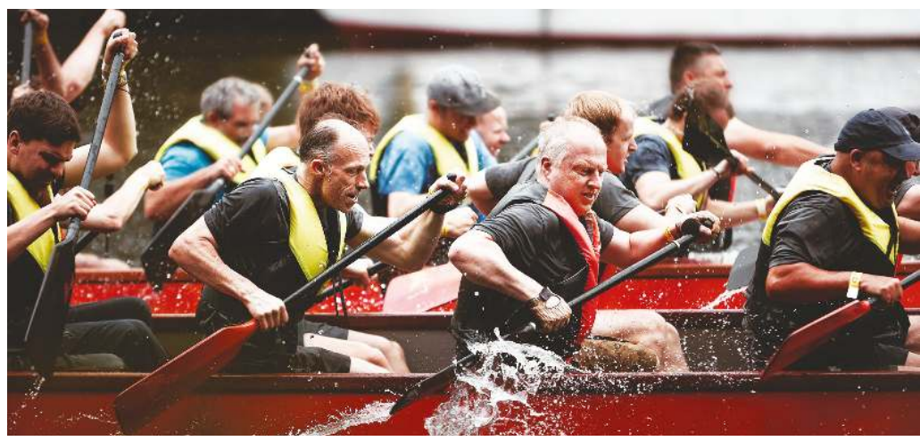
Contact us to join the crew this year

We are looking for a team of up to 14 people including adrummer to beat time for the crew. Races take place every 15 minutes throughout the day with each team racing at least three times over the 250-metre course. The first race takes place at 9.30am and the final one at about 4.30pm.