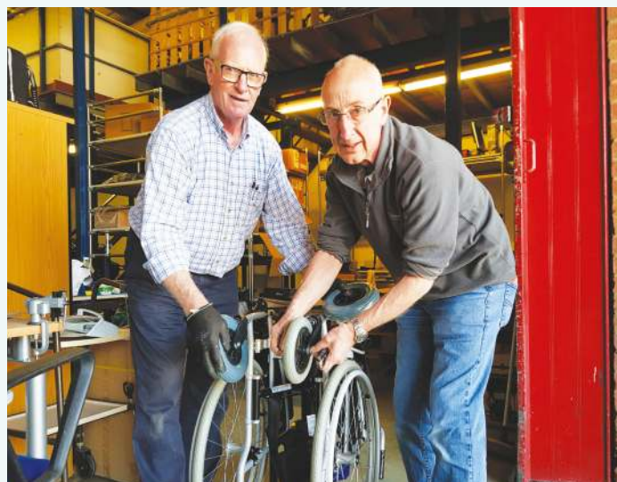
Thank you to all our volunteers at the warehouse!

God has also been working behind the scenes at our warehouse. Over the past two years we have seen many volunteers give up their time to go every Wednesday, clean