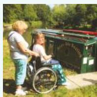
Time For A Break