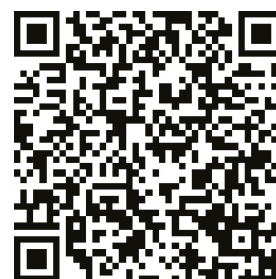
Scan this code with your phone to go straight to the survey

We'd love to hear about your experiences—they could help shape how we work with churches for the next five years!