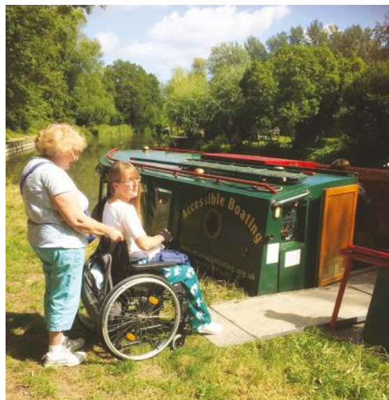
Get on board now for a great break!

The Treloar activity holiday is situated in the heart of Hampshire, at Treloar College, with its fully accessible accommodation. Activities will be drawn from a range of such things as Bowling, Swimming, Climbing, Archery and Cycling. Activities are accessible to all.