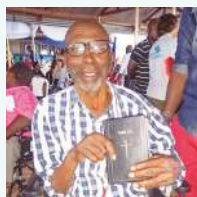
Mkama's Transformed Life