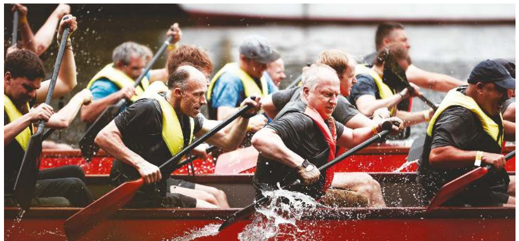
Contact us to join the crew this year

We are looking for a team of up to 14 people including a drummer to beat time for the crew. Races take place every 15 minutes throughout the day with each team racing at least three times over the 250-metre course. The first race takes place at 9.30am and the final one at about 4.30pm.