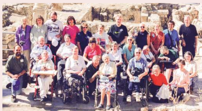
The first DCF holidays trip to Israel